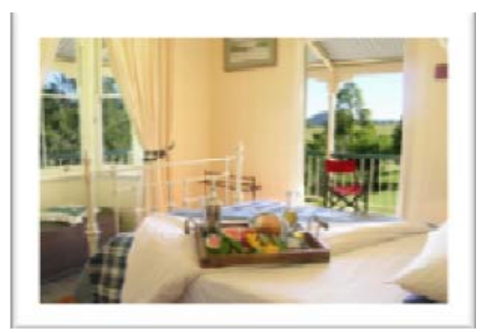
Accomodation at Mt. Barney lodge