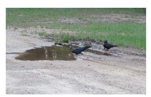
Glossy Black-Cockatoos will occasionally use small puddles as drinking sources.

Large numbers of glossies have also recently returned to the Tweed area where dedicated oberver Rayma Sargeant observed a group of 11 on 22 March. At least three females in this group were recognised from previous monitoring efforts and photographic databases the Rayma has been keeping over the past couple of years. This group regularly feed on the Horsetail Sheoak ( Casuarina equisitifolia ) along the shoreline and make use of a regular drinking spot near Sutherland Point before heading off to roost in the eucalypt woodland further inland.