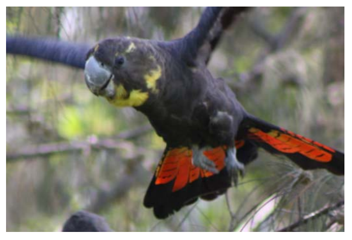
A second photo of Eve, taken one year later on 5/2/2012. The spot in front of her left eye, the larger patch behind the eye as well as the two larger patches around the neck are quite distinctive. Also, the marking on the upper beak (seen more clearly in the above photo) is also consistent with this being the same individual!