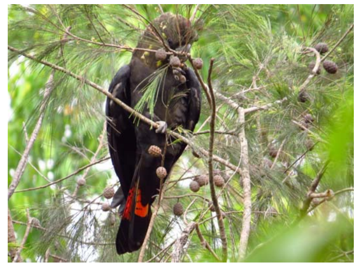
Female Glossy Black-Cockatoo in forefront feeding at Clagiraba (note barring in tail feathers!)

Another pair of glossies was recently sighted at Russell Island in southern Moreton Bay.