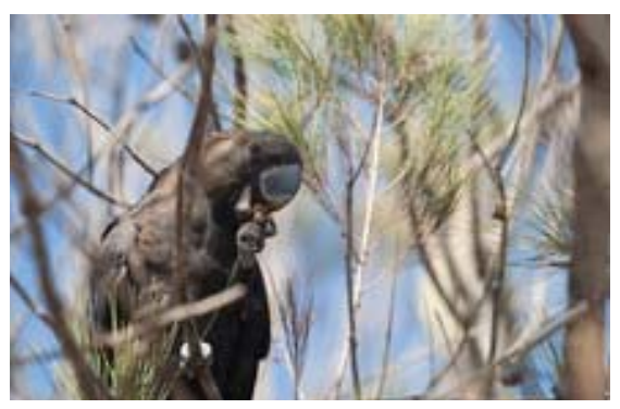
A glossy black returns to a favourite haunt at Mt. Barney

The video can be viewed at the following link: <u>http://national-landscapes.wildiaries.com/trips/11054-</u> <u>The-Glossy-Cockies-of-Mt-Barney</u>