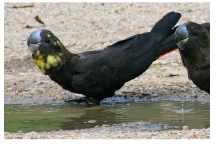
Female Glossy Black-Cockatoos have variable feather patterns on their faces, making it possible to recognise different individuals. This is a photo of 'Eve' taken on 3/3/2011.

Large numbers of glossies have also recently returned to the Tweed area where dedicated oberver Rayma Sargeant observed a group of 11 on 22 March. At least three females in this group were recognised from previous monitoring efforts and photographic databases the Rayma has been keeping over the past couple of years. This group regularly feed on the Horsetail Sheoak ( Casuarina equisitifolia ) along the shoreline and make use of a regular drinking spot near Sutherland Point before heading off to roost in the eucalypt woodland further inland.